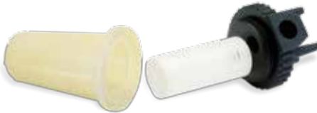
Functional filter prototype printed in clear, white and black rigid plastics

Part accuracy and material performances perfectly suit rapid tooling applications