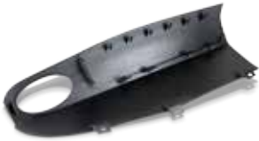
New rigid black plastic Visijet® CR-BK enables even more composite mechanical performances