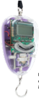
Print transparent, functional components and housings to see internal workings as assembled