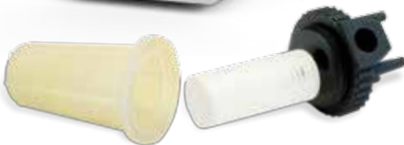
Functional filter prototype printed in clear, white and black rigid plastics

VisiJet M3 materials line delivers toughness, durability, stability, high temperature resistance, watertightness, biocompatibility and castability.