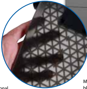
Multi-material prototypes can blend clear, black and white to communicate ideas and simulate finished products