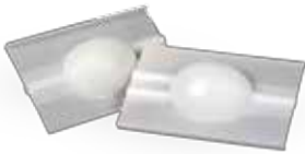
Microfluidic mixers printed in VisiJet SL Flex