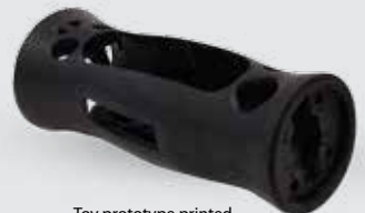
Toy prototype printed in Accura ABS Black

SLA printers are able to print highly detailed, tiny parts just a few mm in size, all the way up to 1.5 m long parts—all at the same exceptional resolution and accuracy. Even large parts remain highly accurate from end-to-end, with virtually no part shrink or warping.