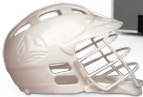
Helmet model printed in Accura Xtreme White 20