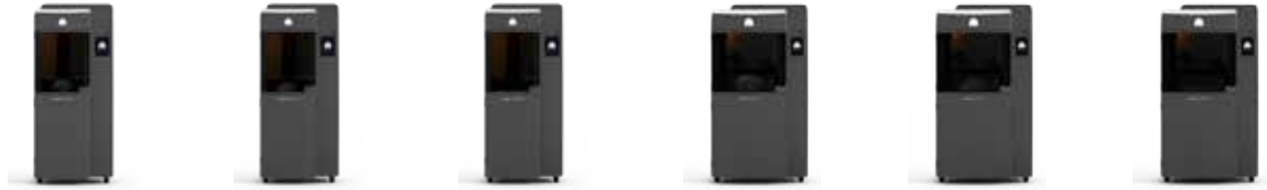
ProJet 6000 SD ProJet 6000 HD ProJet 6000 MP ProJet 7000 SD ProJet 7000 HD ProJet 7000 MP

Extend Innovation. Extend Production. Extend Choices.